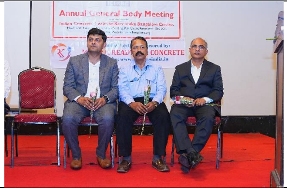
Address by Incoming Chairman ICI (BENC) vision for 2024-2026