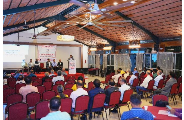
Felicitation to the outgoing Managing Committee members FY 2022-24