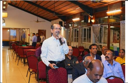
Glimpses of audience & interaction during the AGM 2024